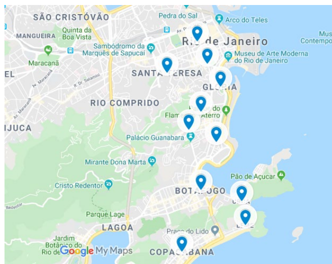
Figure 1. Map of neighborhoods covered by the survey

For the research, the trips made in the neighborhoods Copacabana, Centro, Botafogo, Flamengo, Glória, Leme, Urca, Laranjeiras, Catete, Santa Teresa and Lapa were considered as shown in Figure 1. The neighborhoods are part of the city of Rio de Janeiro, in the state of Rio de Janeiro, with the neighborhoods Centro, Santa Teresa and Lapa belonging to the central area of the city and the rest belonging to the southern area. According to data from Ciclorio (2019), commuting by bicycle between neighborhoods throughout 2016 lasts less than 30 minutes. The average travel time by individual transport in cities with more than one million inhabitants is 30 minutes per trip (Associação Nacional de Transportes Públicos, 2018).