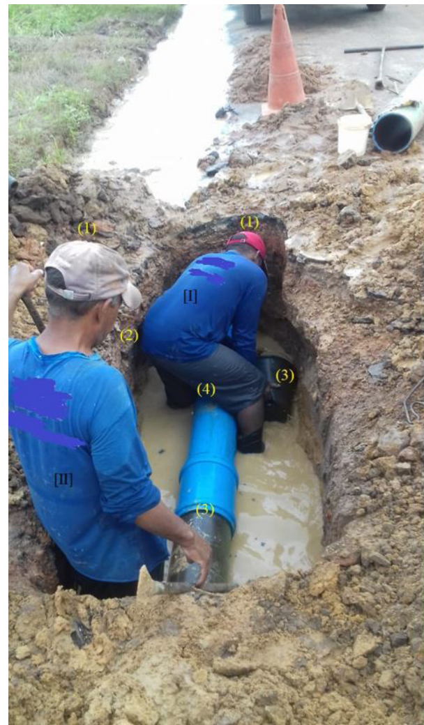
Figure 6 - Employees [I] and [II] in excavations without signaling and without shoring. The absence of helmets (1) is observed; absence of masks against toxic gases (2); absence of protective gloves (3); and garments not suitable for work (4).