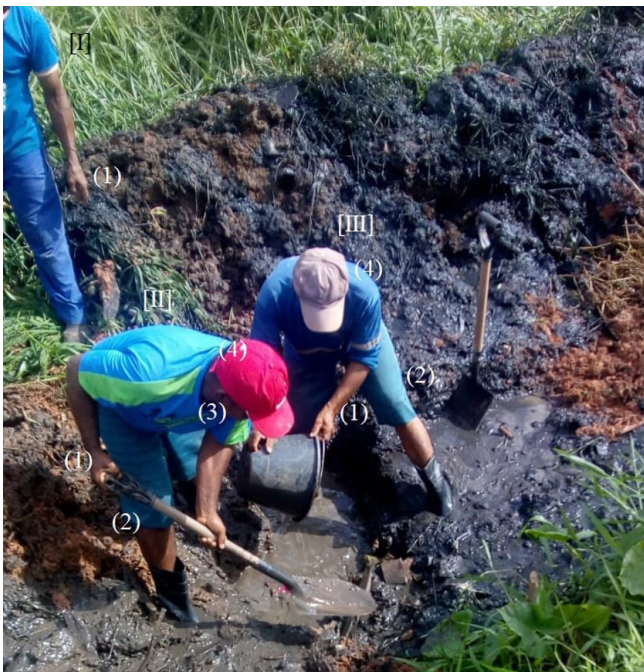
Figure 3 - Employees [I], [II] and [III] in a place of work with poor conditions and nonconformities. Observe the absence of gloves (1), inappropriate work clothes (2) for the workplace, absence of protective masks (3) against toxic gases and absence of helmets (4).