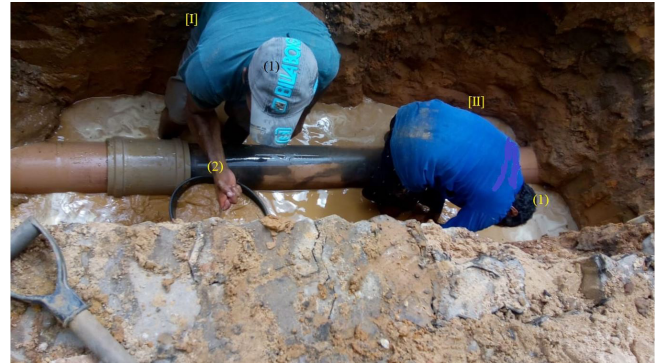
Figure 5 - Employees [I] and [II] working on excavations without shoring. The absence of helmets (1) is observed; inadequate clothing and protective gloves (2).

For Puente et al. (2002), the FMEA has an important methodology to characterize the possible flaws, effects and processes to enumerate actions that can reduce or eliminate each risk. Due to the similarity between failures, the water supply maintenance process was divided into two subprocesses: pipe assembly, which consists of the activities performed during pipe maintenance and tool