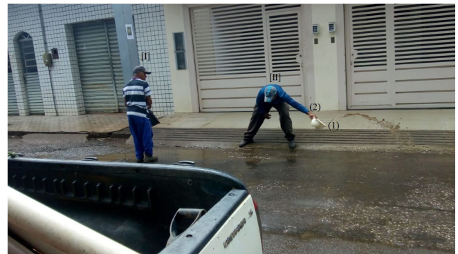
Figure 2 - Employees [I] and [II] with the wrong use of the PPE helmet (1) and absence of protective gloves (2).

Another point to note is where these employees meet. Such an area where the excavation was carried out for maintenance of networks, mostly are unhealthy places, thus compromising the health of the worker himself, due to