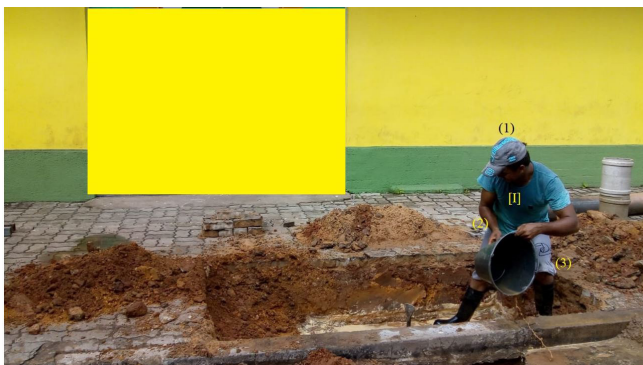
Figure 4 - Employee [I] in a work place close to traffic routes. The absence of a helmet (1) is observed; gloves (2); and garments not suitable for work (3).