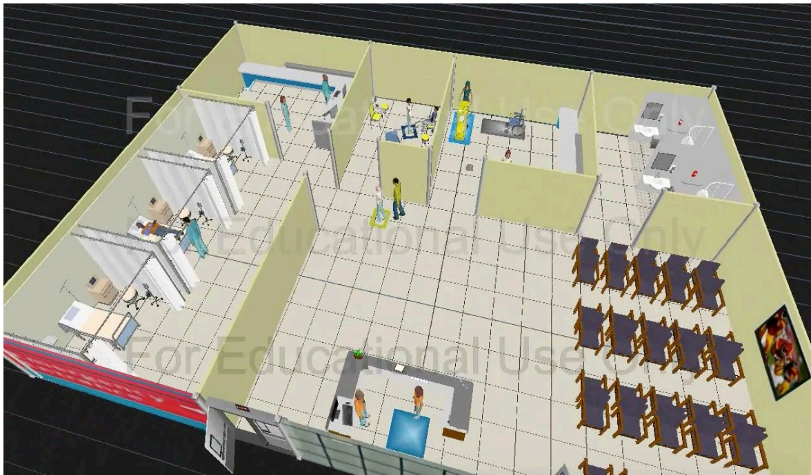
Figure 1. DES model screen view