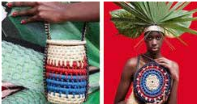
Tubinho Neon Purse / Tambor do Tempo Purse

Figure 2: Fia + Catarina Mina + Neon collaborative scholarships